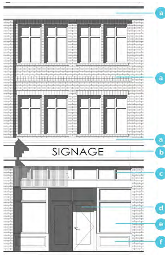
Figure 94-97.- Shopfront Design Standards